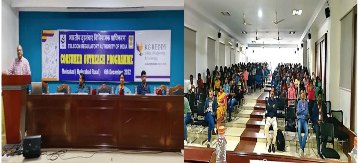
Consumer Outreach Program for students at KG Reddy College of Engineering Moinabad (Hyderabad) held on 06 th December 2022 by Regional Office, Hyderabad