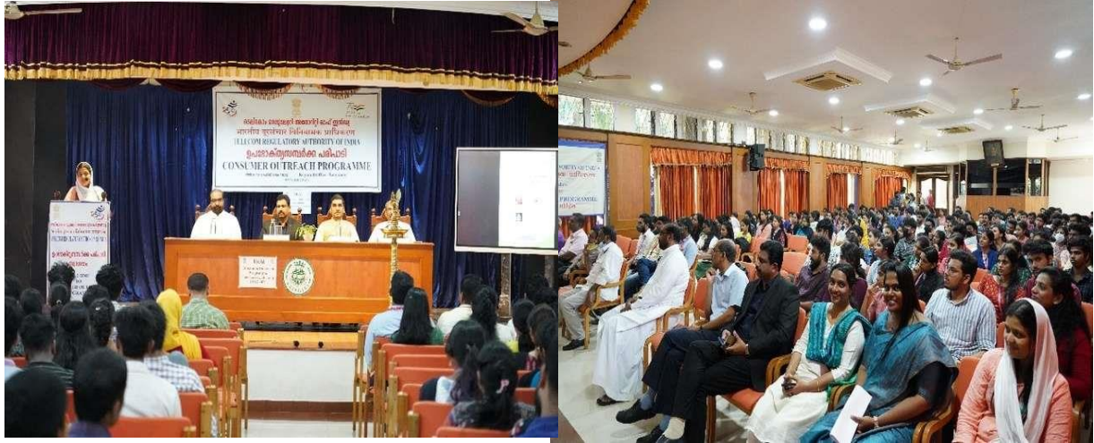
Consumer Outreach Program at Kalamassery (Kerala) held on 13 th December 2022 by Regional Office, Bengaluru