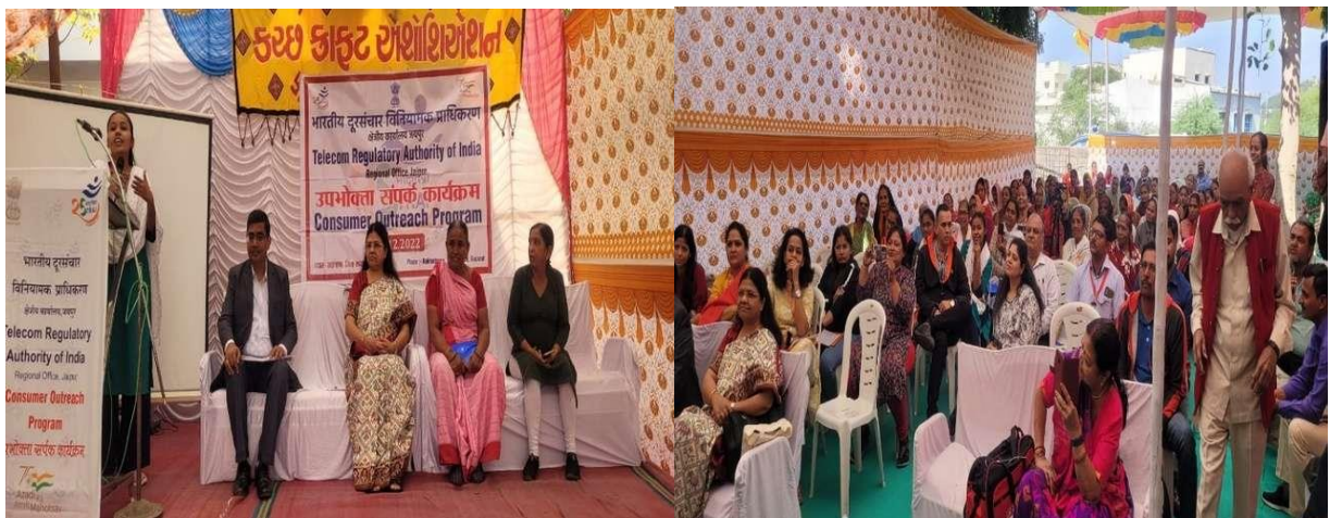
Special Consumer Outreach Program for women members of Kutch Craft Association at Nakhatrana, Gujarat held on 12 th December 2022 by Regional Office, Jaipur