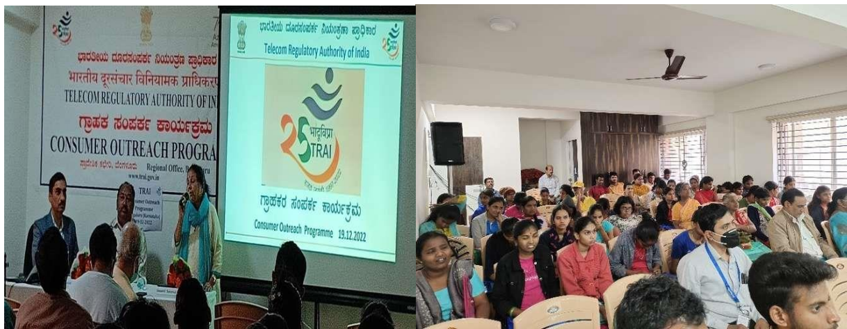
Special Consumer Outreach Program for 'Persons with Disability' at Bengaluru (Karnataka) held on 19 th December 2022 by Regional Office, Bengaluru