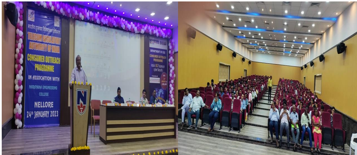
Special Consumer Outreach Program for students at Nellore (Andhra Pradesh) held on 24 th January 23 by Regional Office, Hyderabad