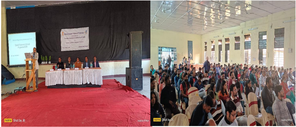
Special Consumer Outreach Program for students at Jalpaiguri (West Bengal) held on 21 st January 23 by Regional Office, Kolkata